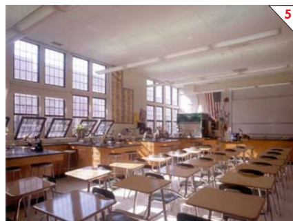
New Science Labs