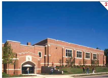
South Entrance at Field House Addition