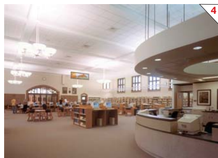
New Learning Resource Center at old Gymnasium